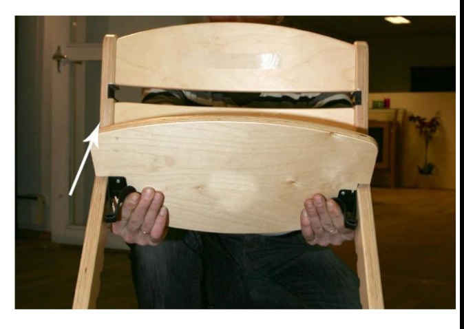
To adjust the height of the seat; stand behind the chair, press both plastic lockers and raise the front end. You can now slide the seat up or down. When the desired height is reached, lower the front end until it snaps into lock. Same procedure on the foot rest.