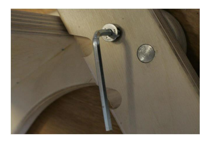
Screw in one bolt on each side and tighten it properly.