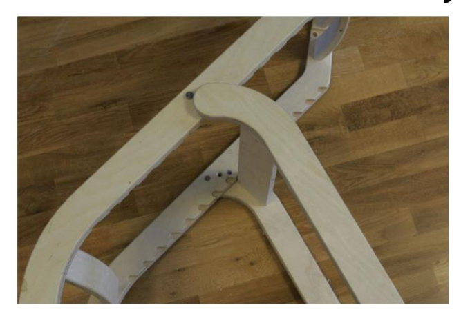
Make sure that the pivot bolt facing the floor hits the pivot hole in the back leg placed on the floor.