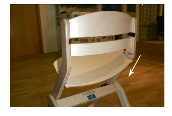
Insert the seat at an angle, turn it until it is level and let it go into a suitable groove on both sides. When the seats front edge is lowered you should hear it snap into locking position. Repeat the procedure on the foot rest. The seat has a "keyhole" underneath, the foot rest has nothing.